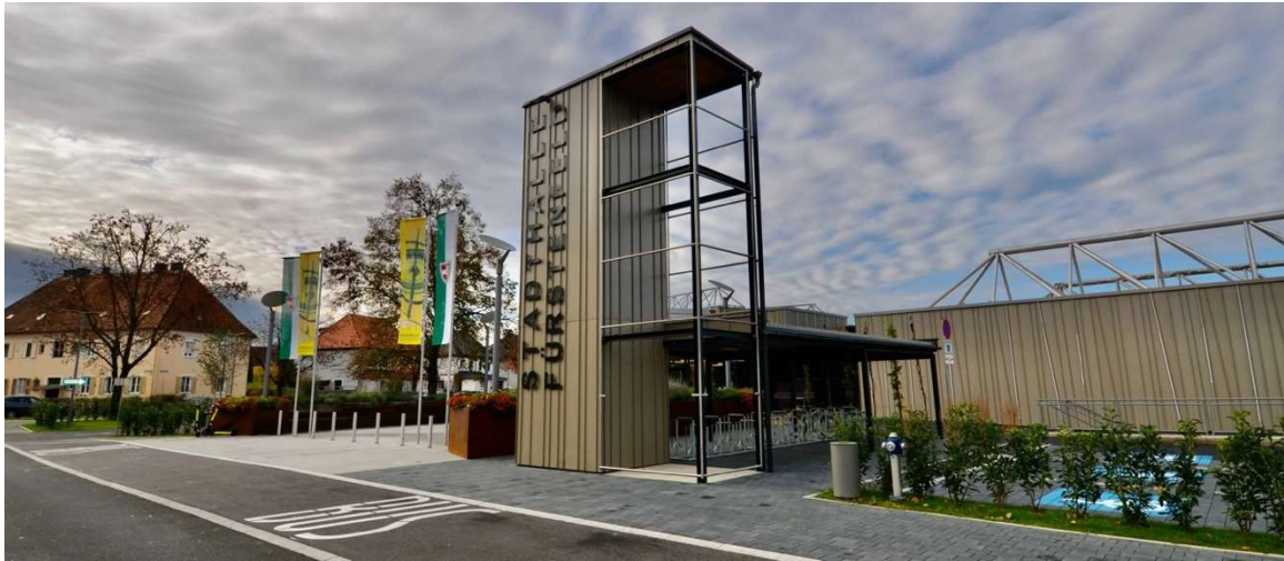
Stadthalle Fürstenfeld, Wallstraße 26, 8280 Fürstenfeld (Preliminaries)