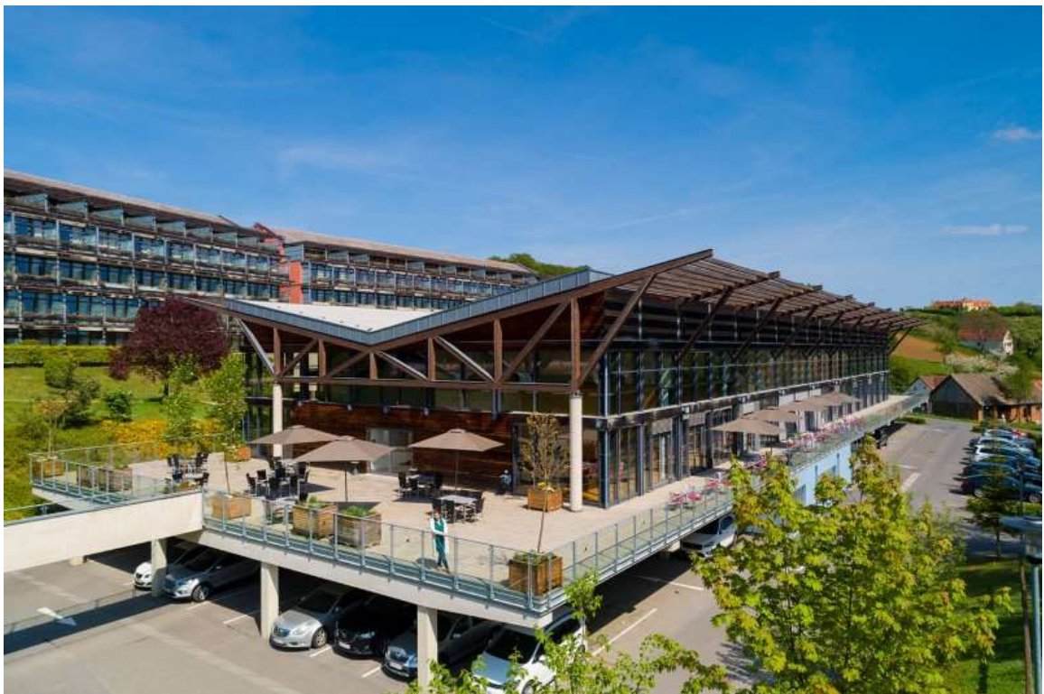
Congress Loipersdorf, Schaffelbadstraße 220, 8282 Bad Loipersdorf (Finals, medal bouts)

CONGRESS LOIPERSDORF SEMINAR | EVENT | MEETING